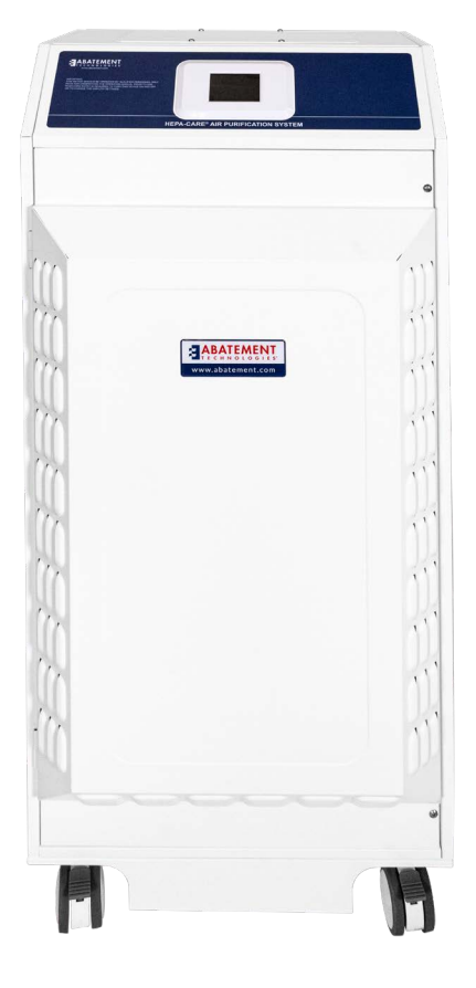
HC800FD PORTABLE AIR PURIFICATION SYSTEM