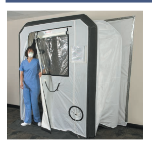
PART NO: HC7917

The HC7917 can be mounted inside a patient room doorway or outside the door, entirely in the corridor.