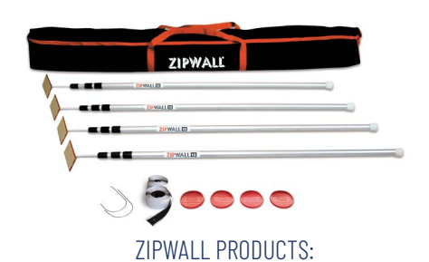
Disposable Zippers, Spring Loaded Poles, Door Kits