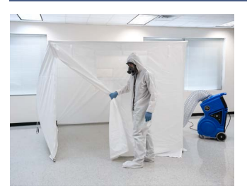
PART NO: 10810

The IQ810 is a flexible, inexpensive and easy way to quickly increase surge patient isolation capacity that one person can pop up in seconds.